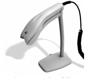
Accessory mount also available